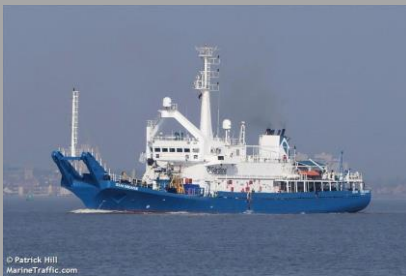
Name: Ocean Endeavour