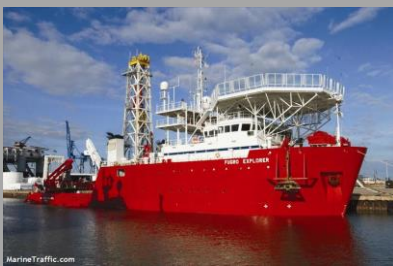
Name: Fugro Explorer

Ocean Endeavour and Fugro Explorer will continue survey efforts thru Jan 2021, focused on possible export cable routes to New York and New Jersey.